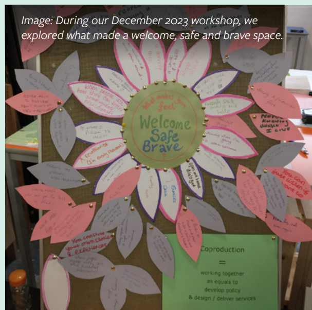
Image: During our December 2023 workshop, we explored what made a welcome, safe and brave space.