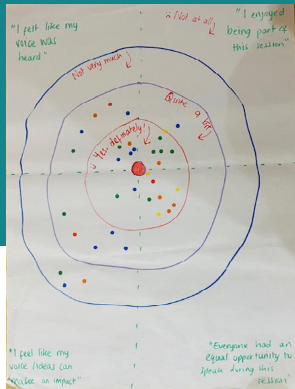
During a workshop with teenage girls, participants shared their feedback on the session

Projects should plan welcome, safe and brave spaces to ensure people feel included as equals. See the ideas and resources on our website for more information.