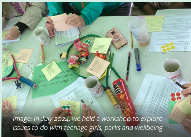
Image: In July 2024, we held a workshop to explore issues to do with teenage girls, parks and wellbeing

We are grateful to everyone involved in Southampton Coproduction Corner so far. This includes community-minded individuals; local community organisations, including Veracity Life , Monty's Community Hub , Board in the City , Owl XL CIC and Southampton Voluntary Services ; public sector partners Southampton City Council and local NHS Trusts ( University Hospital Southampton , Solent and Southern Health NHS Trusts ) and; researchers from the University of Southampton ; and various others.